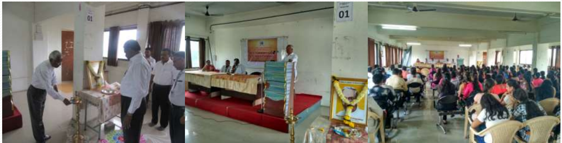
Program On Importance of Library