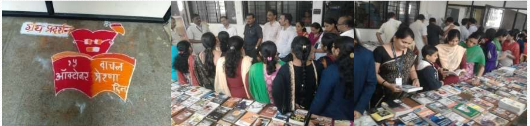
In-House Book Exhibition